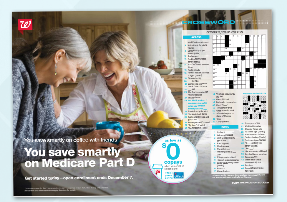
Custom crossword with brand integration

We reach an audience of 7 million television consumers and drive advertisers' business results with unparalleled integrated marketing solutions. With unmatched access to celebrity talent, our marketing, editorial and design teams collaborate to push the boundaries on integration and creativity with custom content, high-quality visual designs and strategic placements.