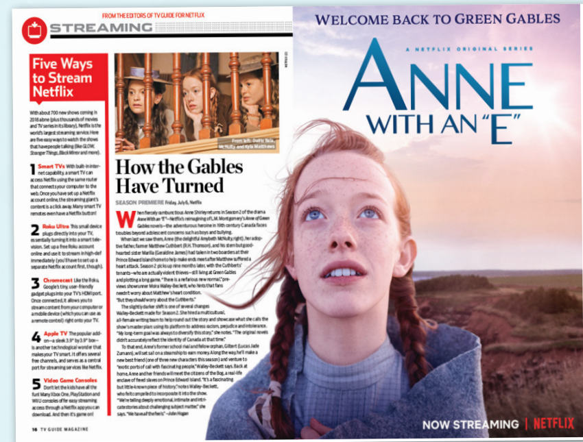
Editorial feature, custom with brand integration