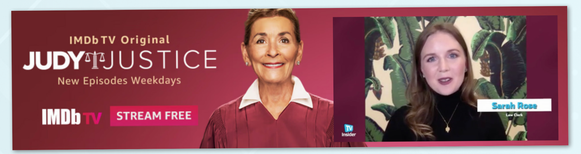
Digital editorial interview inside a custom ad environment